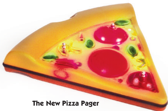
The New Pizza Pager