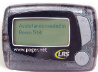
LRS Alphanumeric Staff Pager