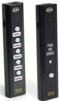
Butler II Pushbutton Paging Transmitter

That way your guests can relax...and so can you.